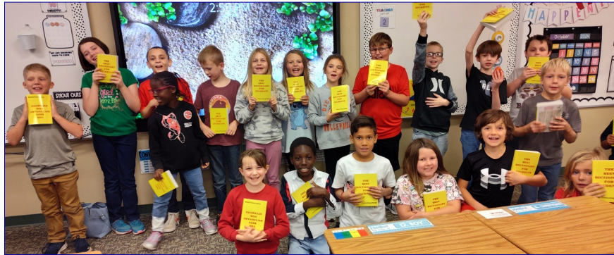
Prairie Rose Elementary.