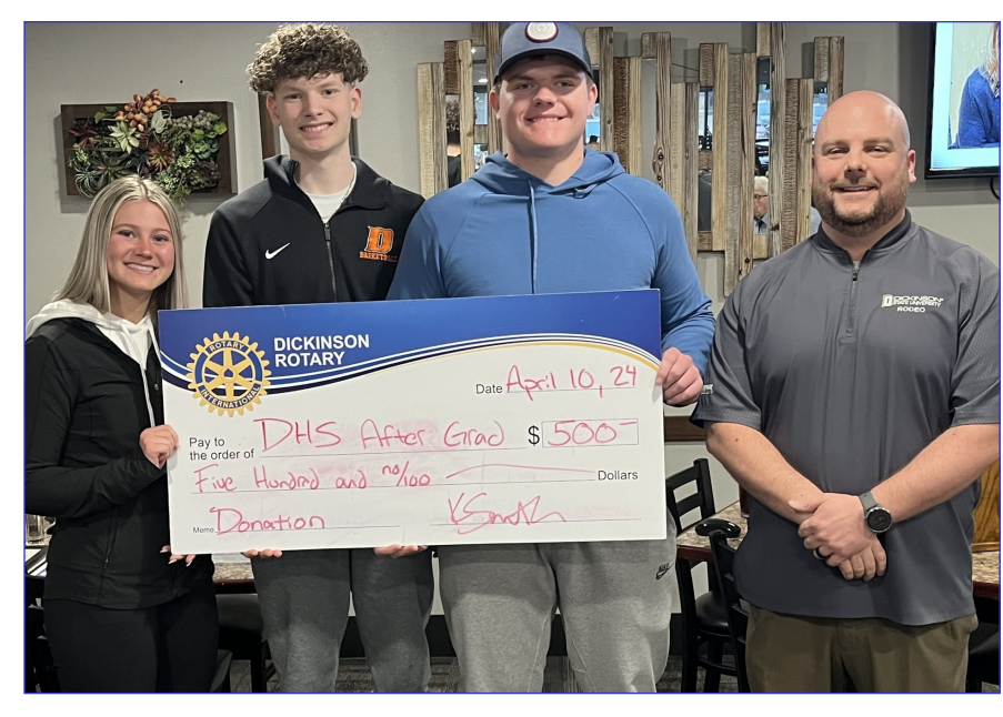
Rotary supports our youth: The After Graduation Party is one way of helping graduating seniors stay safe while celebrating together. The DHS After Grad Party will have food, games, prizes and activities all night for Dickinson High School students.